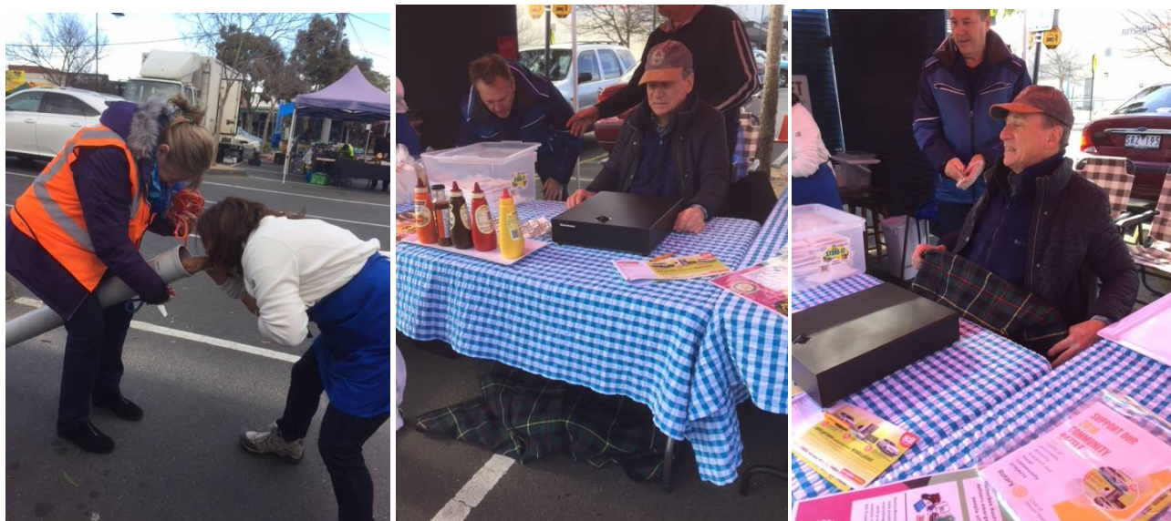
Photos from today's Market.