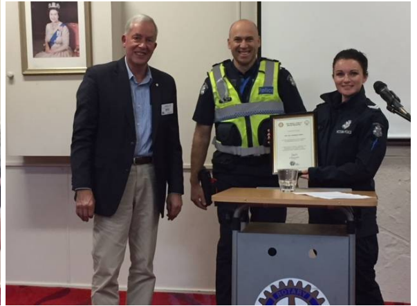
Certificate of Appreciation